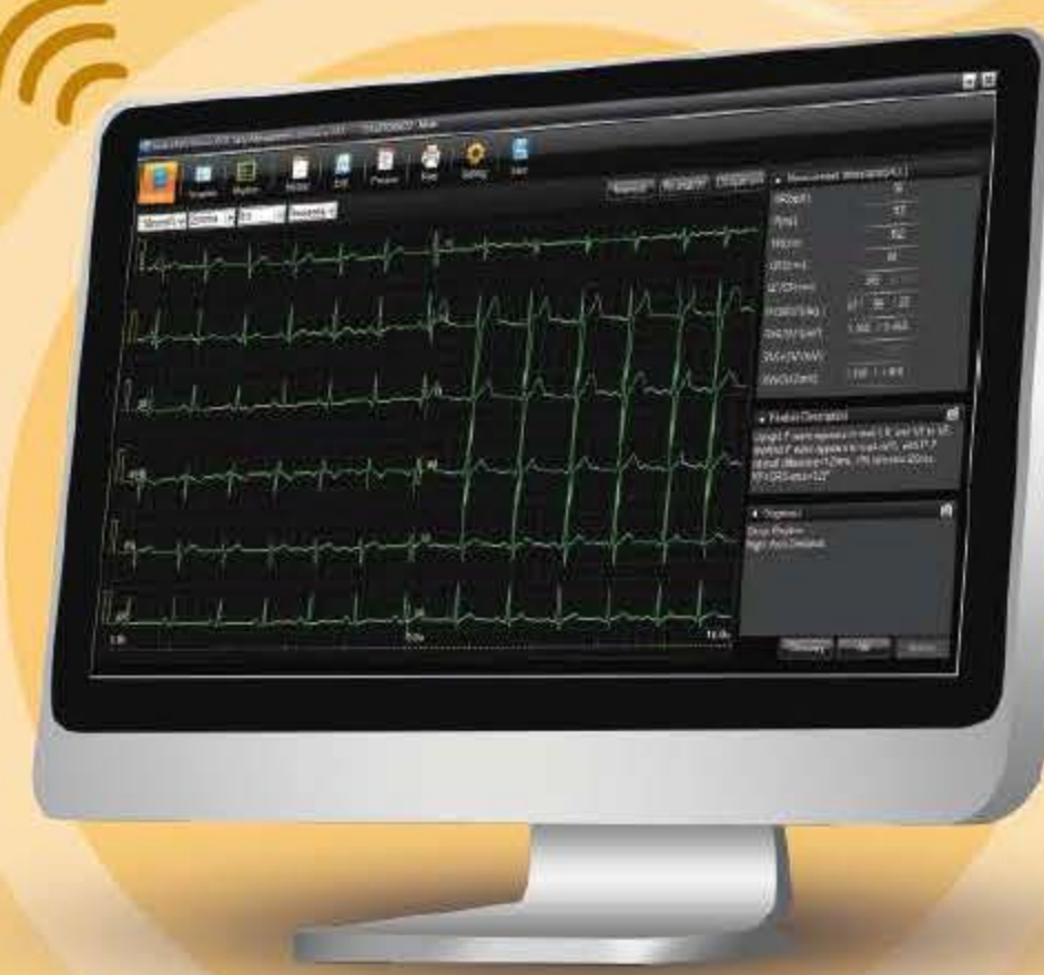
Smart ECG Viewer