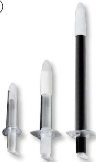
85x20mm 130x20mm 250x20mm