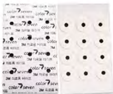
3M double sided tape for Medical Use