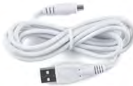
USB Charging Cable