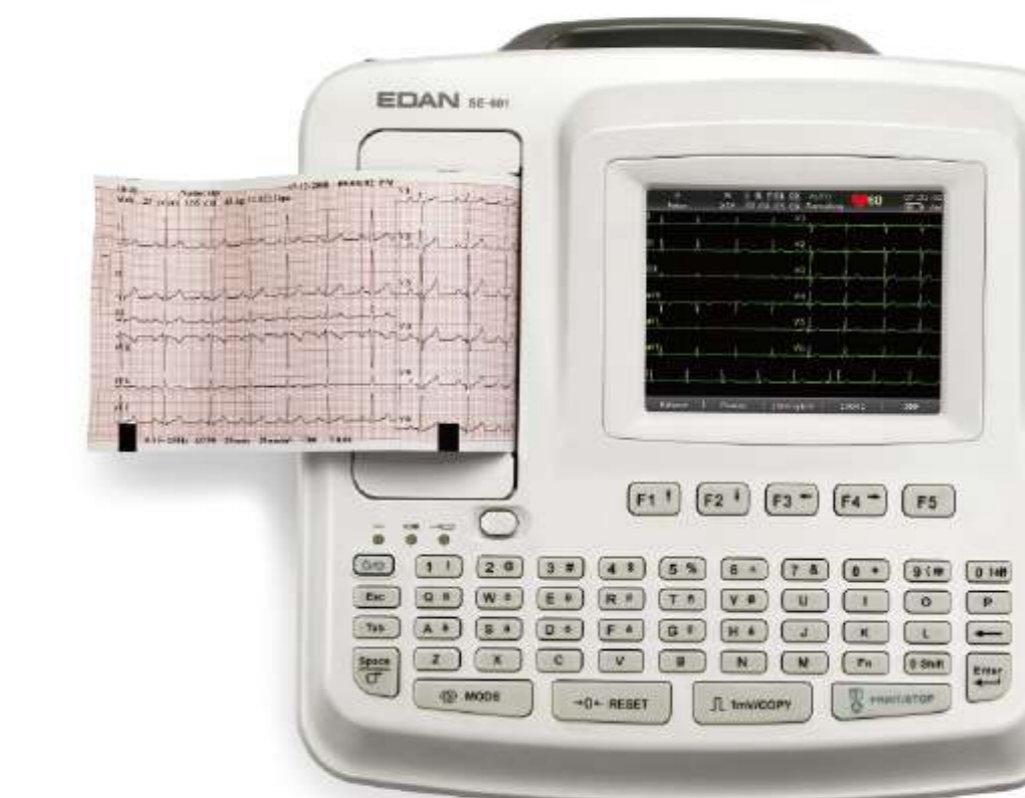
SE-601B (5.7" Color LCD Display)