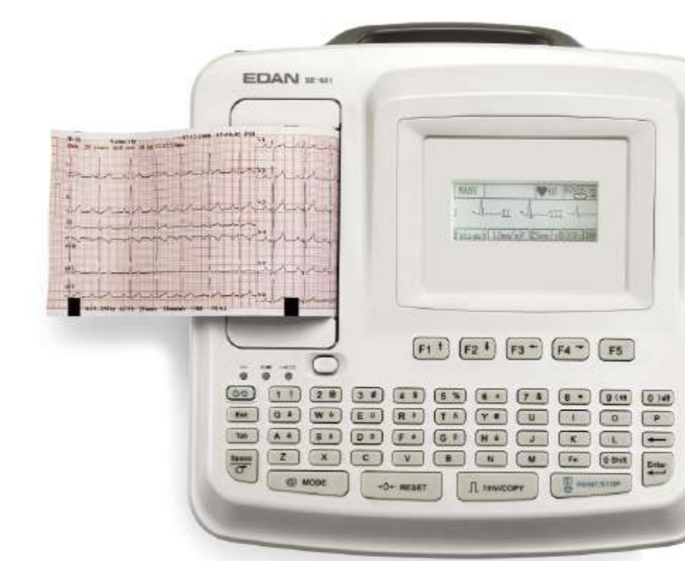
SE-601A (3.5" Single Color LCD Display)