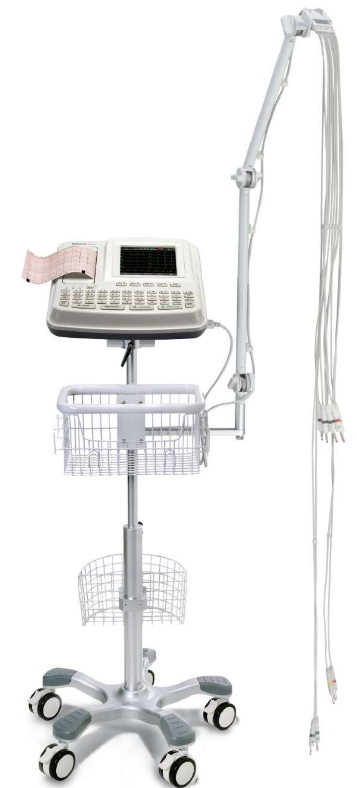
SE-601C With Rolling Stand (5.7" Color Touch Screen)