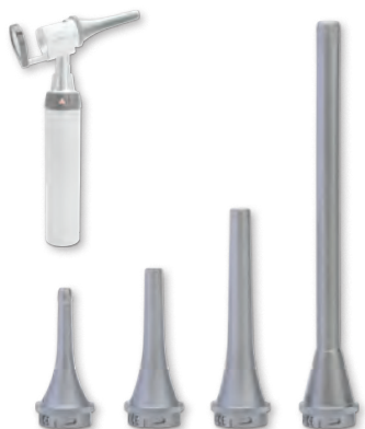
57 mm 65 mm 90 mm 170 mm 4 mm dia. 6 mm dia. 7 mm dia. 10 mm dia.