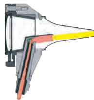
Direct Xenon Halogen illumination