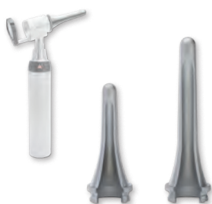
65 mm long 90 mm long 6 mm dia. 7 mm dia.