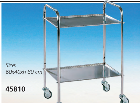
Size: 60x40xh 80 cm