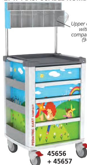
45656 + 45657