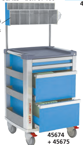
45674 + 45675