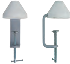
Table fixing. Cod. B010190