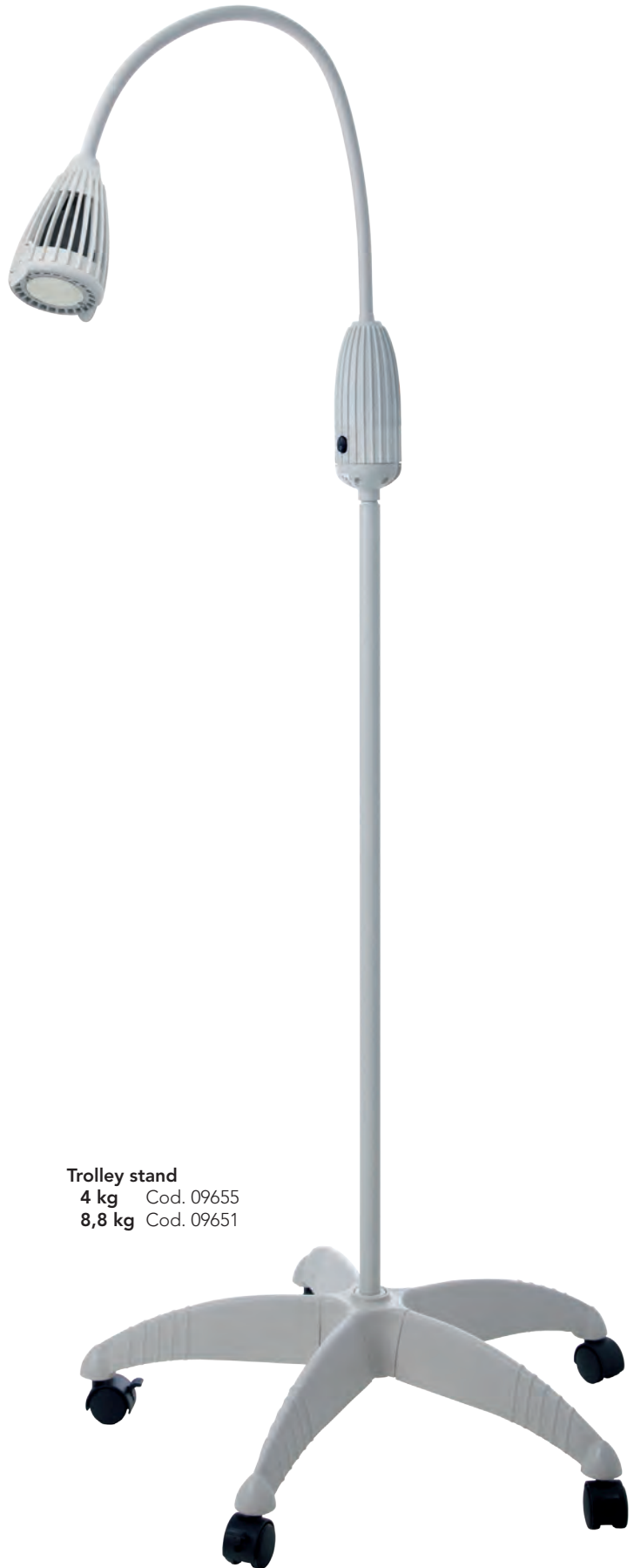
Trolley stand 4 kg Cod. 09655 8,8 kg Cod. 09651