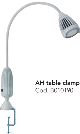
AH table clamp Cod. B010190