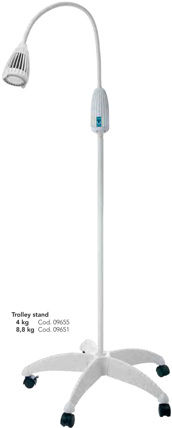
Trolley stand 4 kg Cod. 09655 8,8 kg Cod. 09651