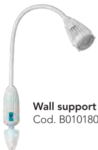
Wall support Cod. B0101800