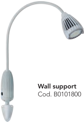
Wall support Cod. B0101800