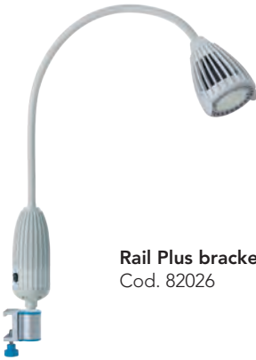
Rail Plus bracket Cod. 82026