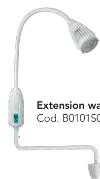
Extension wall arm Cod. B010150