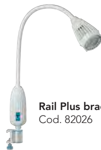
Rail Plus bracket Cod. 82026