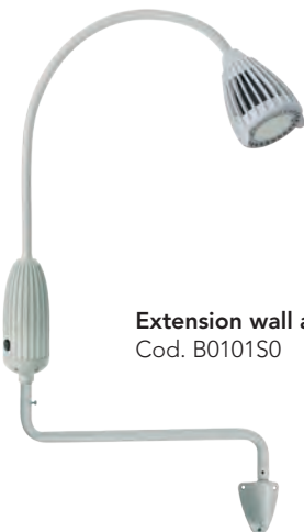
Extension wall arm Cod. B0101S0