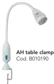
AH table clamp Cod. B010190