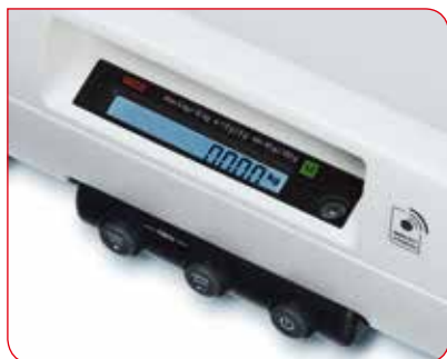
The new backlit LCD display ensures an easy reading of the digits, even in dimmed rooms.