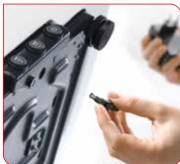
Can be operated by battery or power adapter.