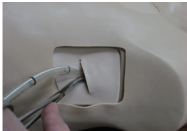
c. Thoracic Drainage (Left and Right)