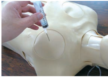
b. Thoracentesis (Left and Right)