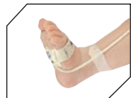
Neonate Flex System (< 2 kg / < 4 lbs)