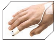
Adult Flex System (> 20 kg / > 44 lbs)