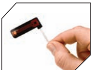
8001J Neonate Flex Sensor