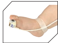
Infant Flex System (2–20 kg / 4–44 lbs)