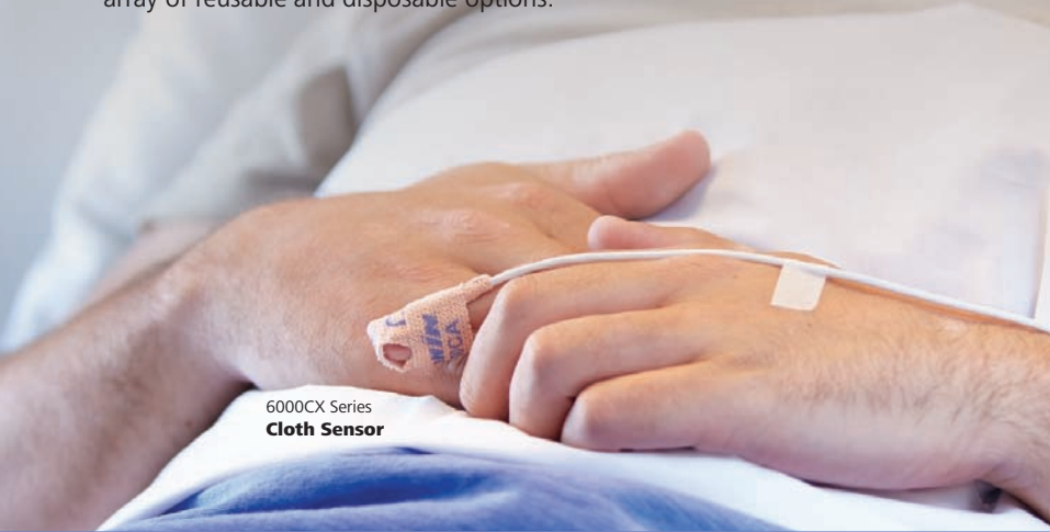
6000CX Series Cloth Sensor

Nonin's PureLight sensor technology boasts pure red and infrared LEDs to create unparalleled accuracy — even at critical SpO 2 levels. Choose from an array of reusable and disposable options.