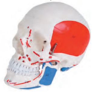
• 40156 HUMAN SKULL 1X NUMERATED - 3 parts