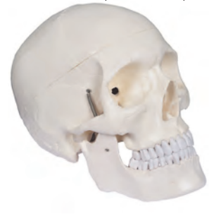
• 40155 HUMAN SKULL 1X -3 parts

A detailed reproduction of a life size human skull with all structural details. The mandible is articulated, the skullcap is removable to show internal details. All of the joints, sutures, fissures, foramina and processes are portrayed with utmost accuracy.