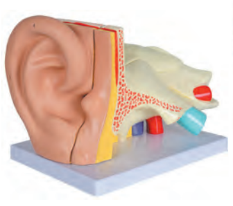
• 40039 EAR 3X - 5 parts

Also cochlea and labyrinth with vestibular and cochlear nerves and 2 bones sections (40039 only) that define the middle and inner ear are removable.