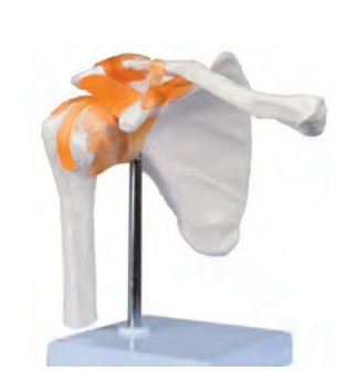
40139 SHOULDER JOINT