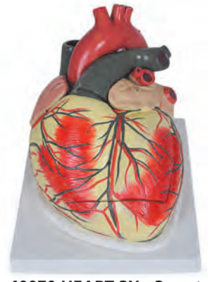
• 40070 HEART 3X - 3 parts