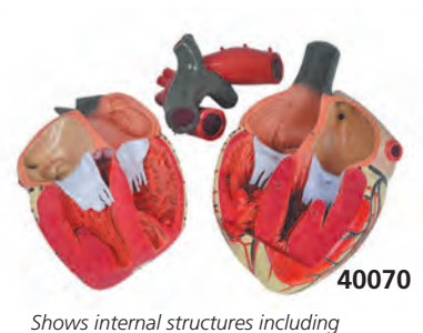
the cardiac valves and the comparative morphology of the right and left ventricles.