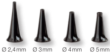
Ø 2,4 mm Ø 3 mm Ø 4 mm Ø 5 mm