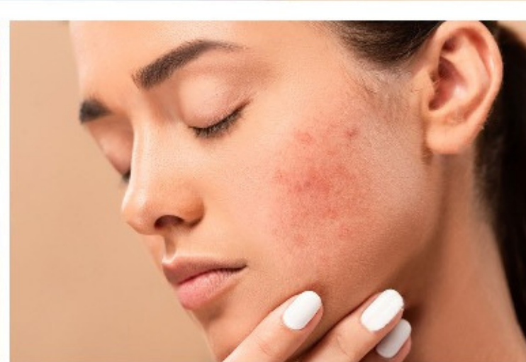
Fade acne scars