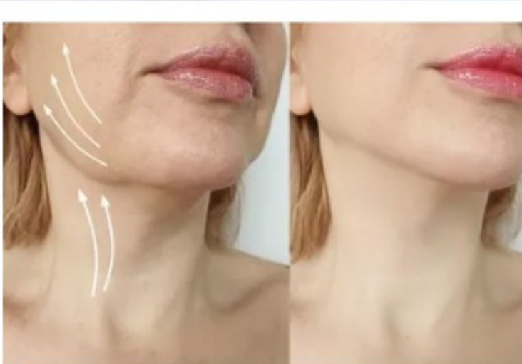
Lift and firm the skin