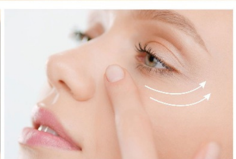
Lighten fine lines