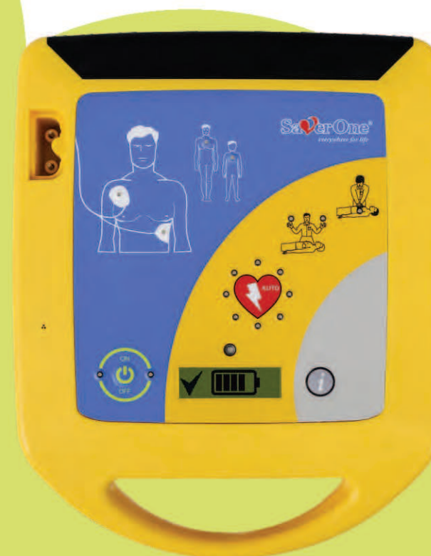
FULLY AUTOMATIC one button