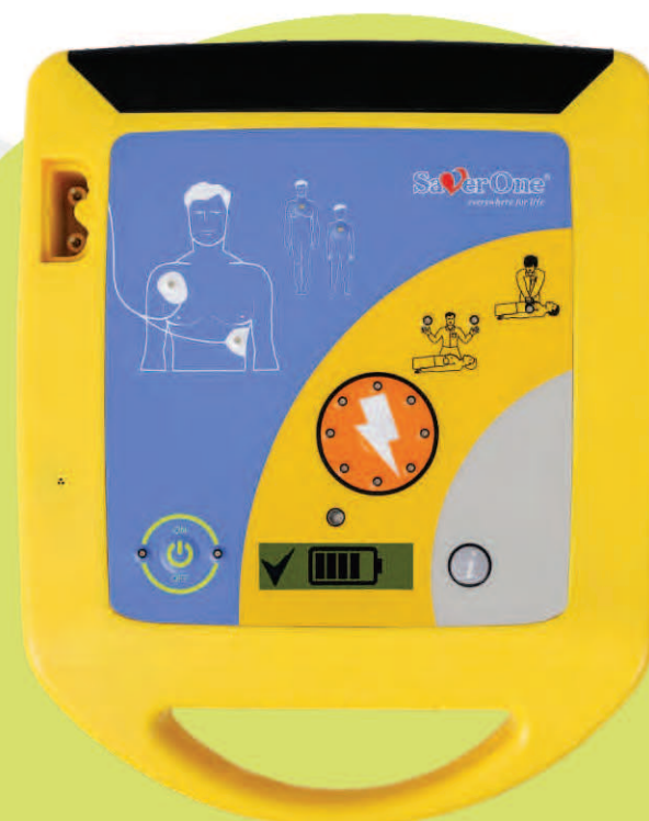
SEMI-AUTOMATIC two buttons

Adult / Child Capability: Can be used on patients of any age with flashing icons on the keyboard providing information on the pads in use. Device senses when Pediatric pads are installed and adjusts to use a more appropriate lower energy level (50J).