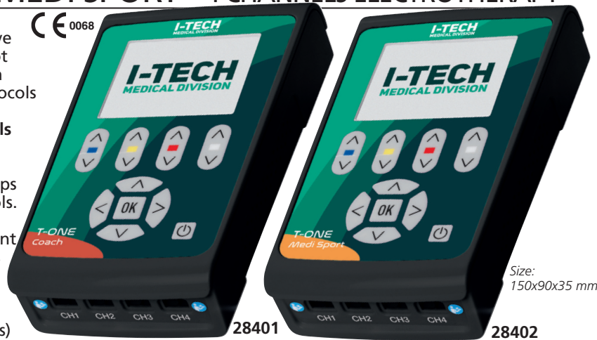
Size: 150x90x35 mm