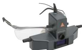
SIGMA 250 apertures