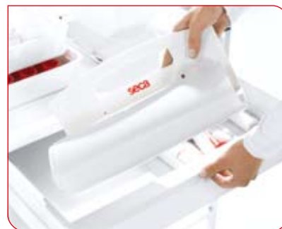
The measuring mat can be rolled up for space-saving storage.