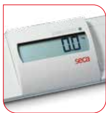
The patient's BMI can be determined when his height is entered.

The low platform profile reduces patient effort and risk when stepping on the scale. As the 22 x 22 inch platform is almost twice as large as that of a normal scale, a chair may also be placed on the scale for weighing a patient. With the pre-TARE function, the weight of a chair or standing aid can simply be tared away. Up to 3 TARE weights (e.g. chair weights) can be stored.