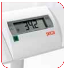
The patient's BMI can be determined when his height is entered.

The low platform profile reduces patient effort and risk when stepping on the scale. As the 22 x 22 inch platform is almost twice as large as that of a normal scale, a chair may also be placed on the scale for weighing a patient. With the pre-TARE function, the weight of a chair or standing aid can simply be tared away. Up to 3 TARE weights (e.g. chair weights) can be stored.