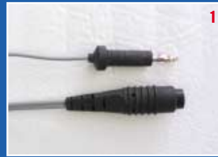
190-190 MONOPOLAR CABLE M4-F4 3 mt