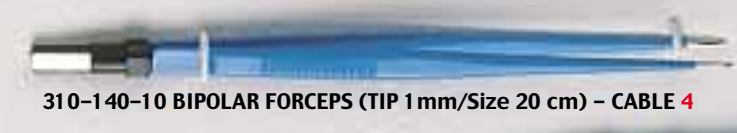
310-140-10 BIPOLAR FORCEPS (TIP 1mm/Size 20 cm) - CABLE 4