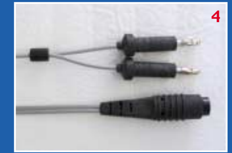
190-110 SILICONE BIPOLAR CABLE 3 mt