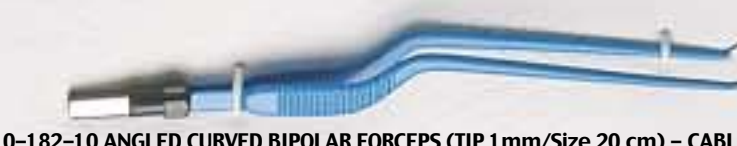
310-182-10 ANGLED CURVED BIPOLAR FORCEPS (TIP 1mm/Size 20 cm) - CABLE 4