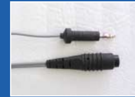
190-185 MONOPOLAR CABLE M4-MP4 3 mt