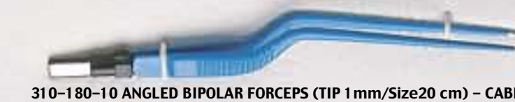
310-180-10 ANGLED BIPOLAR FORCEPS (TIP 1mm/Size 20 cm) - CABLE 4