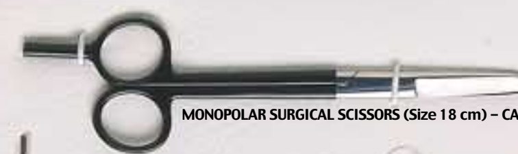
MONOPOLAR SURGICAL SCISSORS (Size 18 cm) - CABLE 3