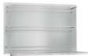
BEDPANS Wall mounted dripping and storage shelf