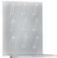
URINALS Wall mounted dripping and storage shelf