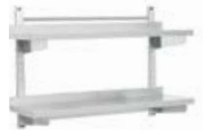
MULTI FUNCTIONAL Wall mounted storage shelves