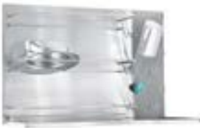
URINALS&BEDPANS Wall mounted dripping and storage shelf