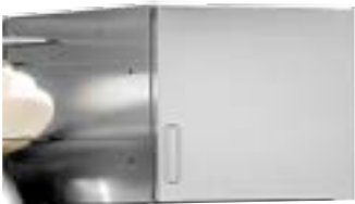
STAINLESS STEEL TOP CABINET

With hinged door to install above washing and disinfecting machine.