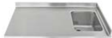
WORKPLATE WITH BASIN

Stainless steel wall mounted cabinets open or with hinged doors. Internally heating available.