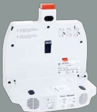
PRIMEDIC™ Charger Base Vehicle charging bracket (12V) for HeartSave and XD