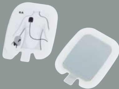
PRIMEDIC™ SavePads Connect (1 pair)