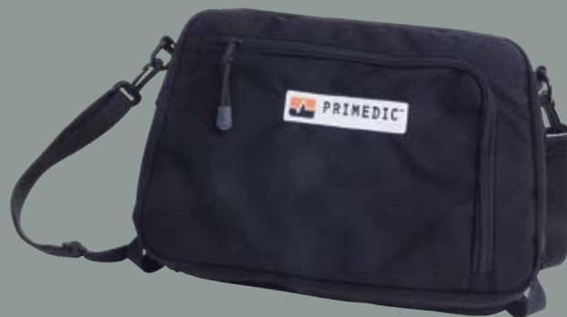
PRIMEDIC™ accessories case XD with storage pockets and carrying strap