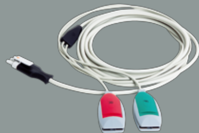
PRIMEDIC™ SavePads Connect cable, 2 pole for connecting PRIMEDIC™ SavePads Defibrillation electrodes for adults including cables and plugs