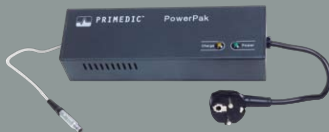
PRIMEDIC™ PowerPak Charger unit for AkuPak