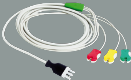
PRIMEDIC™ EKG patient cable 3 pole for connecting ECG electrodes for 6 channel ECG, including cables and plugs. Only for monitoring

Additional accessories available on request.