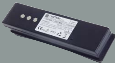
PRIMEDIC™ AkuPak Rechargeable battery with charging contacts for charger and socket for PRIMEDIC™ PowerPak