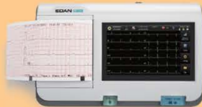
SE-301 3-Channel ECG