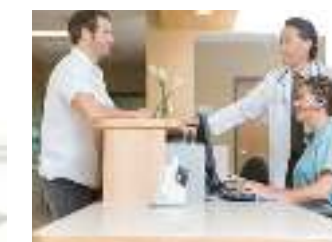
Stored and charged at nurse station