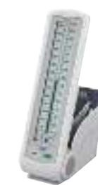
B-type Stand-alone use