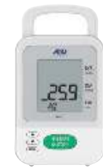
Stand-by display (Room temperature)