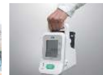
Easy to carry