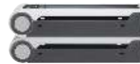
Flat base for stacking multiple units