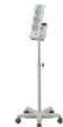
In combination with optional mobile stand