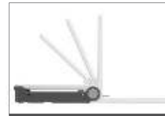
Easy display adjustment