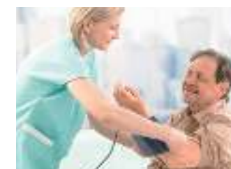
Measurement at ward