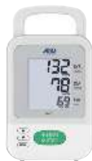
Measurement display (with backlight)