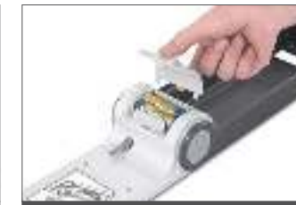
Easy battery replacement