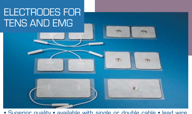
• Superior quality • available with single or double cable • lead wire with 2 mm socket or press-stud connection • manufactured in compliance with EN ISO 9001 and AAMI standards.