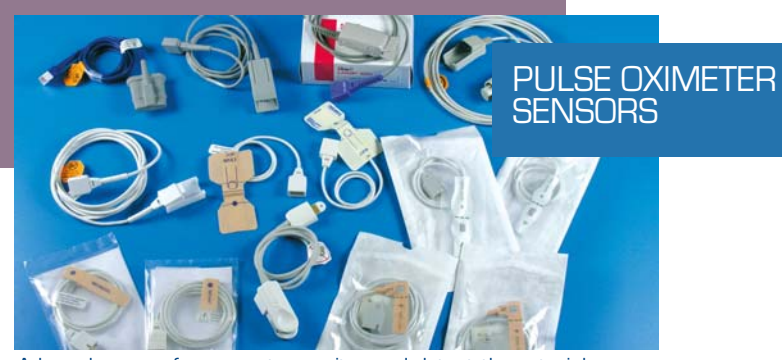
A broad range of sensors to monitor and detect the arterial oxygen saturation. Excellent quality and proven accuracy are the characteristics that better describe a whole series of disposable and reusable sensors. Suitable for all the main fittings spread on the market.