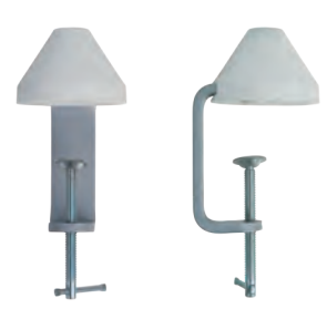
Table fixing. Cod. B010190