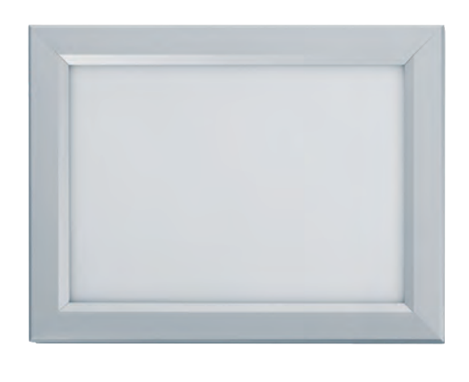
Front view and extraslim profile view detail AF 400 LED version