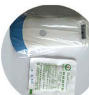
Disposable probe cover