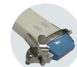
Needle puncture guide