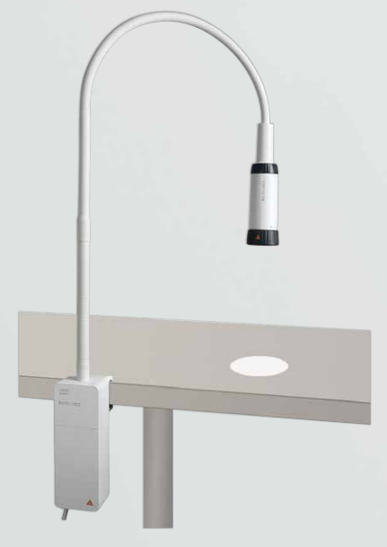
EL10 LED Examination Light with clamp mount